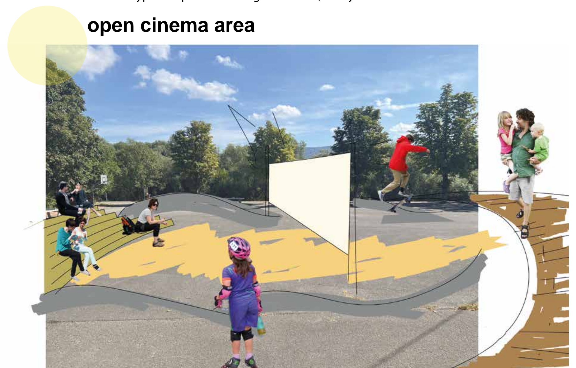
open cinema area

This area uses the existing landscape such as the slope to create a play area for children of all ages. The area can have a water-sand playground, tree houses, a slide right into the Neckar River and other exciting recreation activities